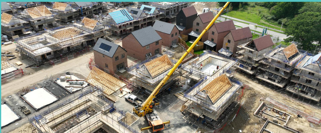
Construction works at Vistry's Oakhurst site in the eastern part of Brookleigh