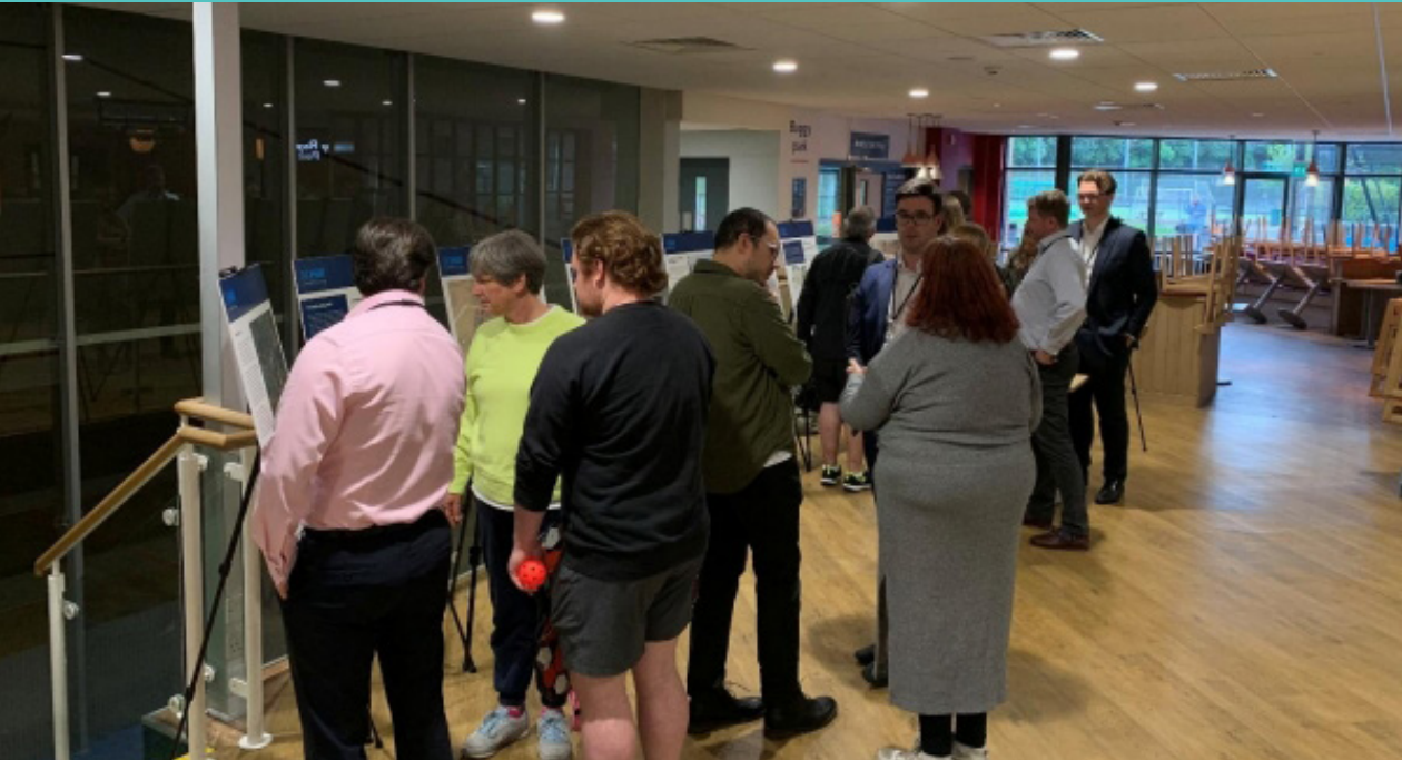
Attendees at one of The Hill Group’s public consultation community events

The Hill Group has submitted plans to build approximately 270 homes to the east of the Brookleigh site near the existing Bellway and Vistry plots. Of these 270 homes, 30% will be affordable housing.