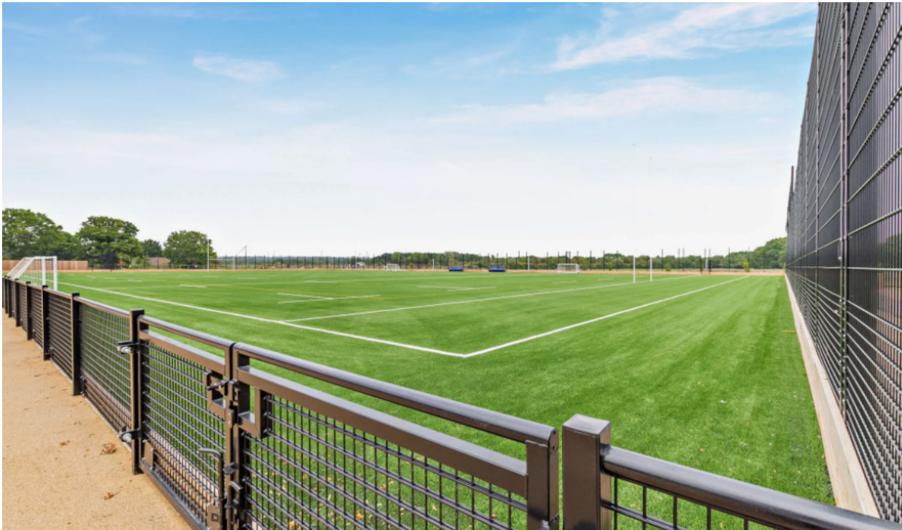
Images showing one of the new outdoor sports pitches at the Arc