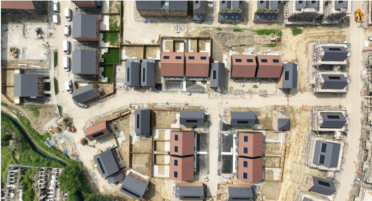
A drone image of the new homes being constructed by Vistry at Oakhurst, Brookleigh

Vistry is building 460 new homes at Oakhurst, off Freeks Lane. Vistry has completed its first phase of homes at Brookleigh and is progressing well with its second phase. Construction on Phase 3 is due to commence early next year.