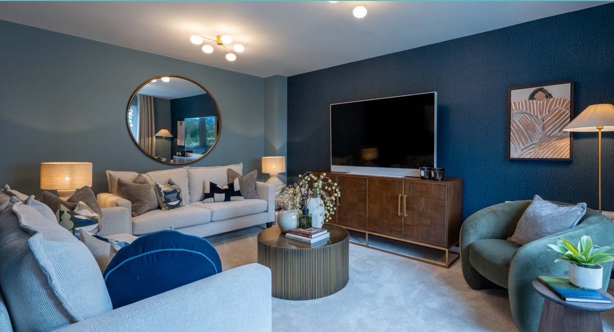
A photo inside one of Bellway’s new homes at Brookleigh

Bellway is building 247 homes at its Fallow Wood View site off Isaacs Lane, 30% of which will be affordable housing, operated by Clarion.