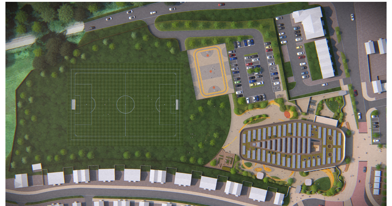
CGIs showing the proposed Primary School