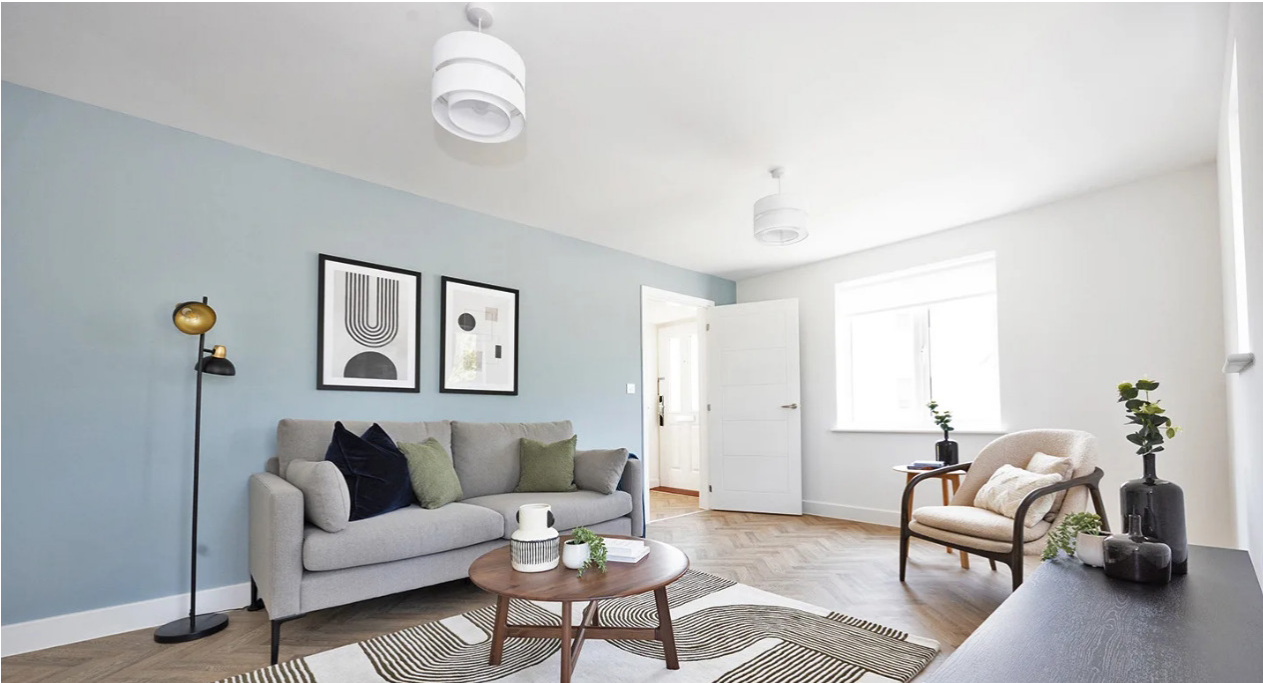
Inside an Oakhurst affordable home at Brookleigh

Of the 3,500 homes to be delivered at Brookleigh by Homes England’s developer partners, 30% will be affordable housing. This 30% is split between 70% affordable rent and 30% shared ownership.