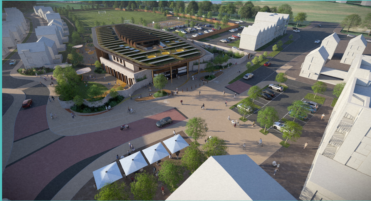
CGIs showing the proposed Primary School

Homes England is building the first of two primary schools at Brookleigh.