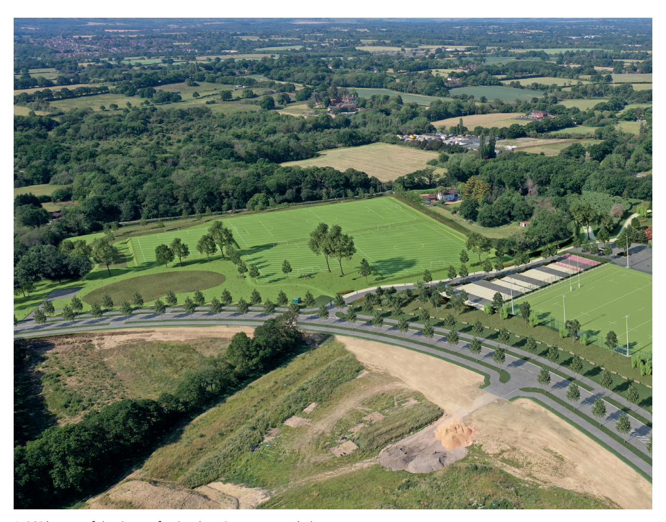
A CGI image of the Centre for Outdoor Sport sports pitches