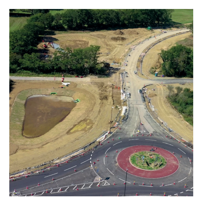
Image of the Western Link Road and south basin pond under construction

For more information about Jackson Civil Engineering, visit www.jackson-civils.co.uk/