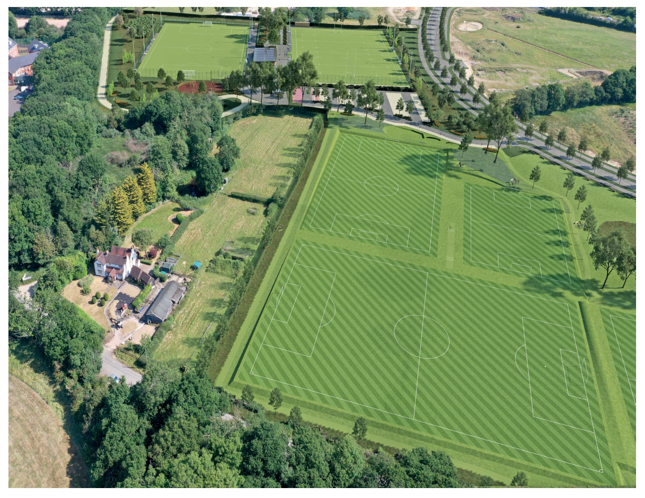
A CGI image of the new pitches at the Centre for Outdoor Sport

Keep an eye on the Brookleigh Facebook page for more information about the planning application for the Centre for Outdoor Sport.