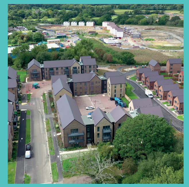
Image of the Phase 1 affordable homes at Oakhurst, Brookleigh, developed by Countryside Partnerships