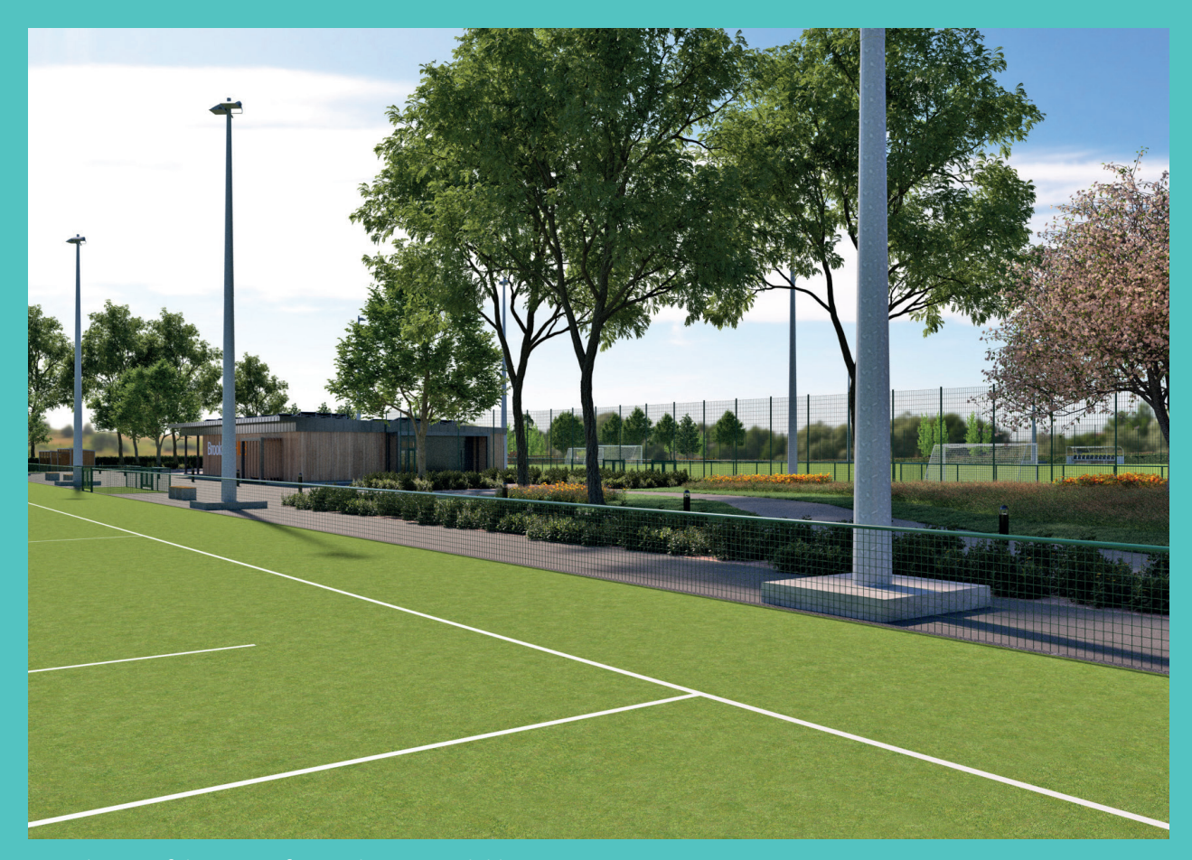
A CGI image of the Centre for Outdoor Sport clubhouse

extension to the Triangle Leisure Centre, providing high quality, publicly owned sports pitches for the Burgess Hill community. Homes England has donated the land for the Centre to Mid Sussex District Council (MSDC), along with payments towards building and maintaining the centre.